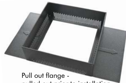
Pull out flange - pulled out prior to installation