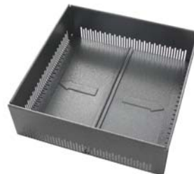
Pull out flange - inside the chamber for easy transportation and storage